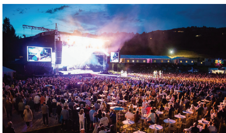
View from the National Council Upper Deck Seating