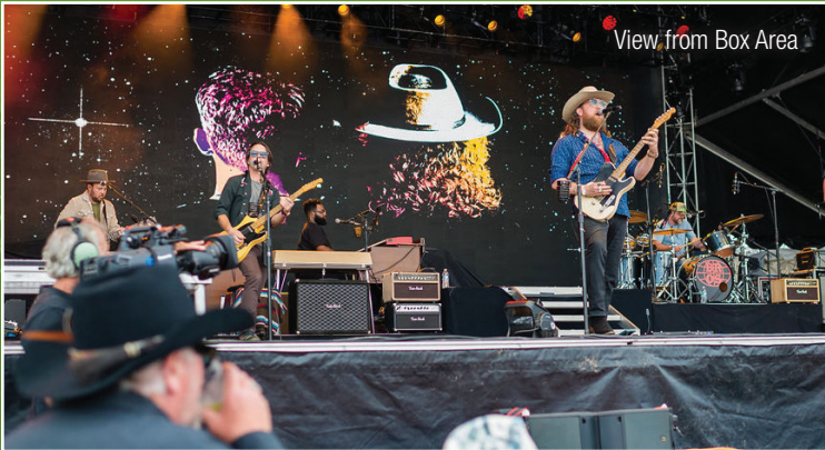
View from Box Area

$2,000 discount off price if purchased before 12.31.23