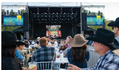
View from the National Council Patio Tables