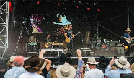
View from the Gold Standing Room Only Area

$11,500 per couple $7,750 Contribution / $3,750 Fair Market Value - Parking Sold Separately